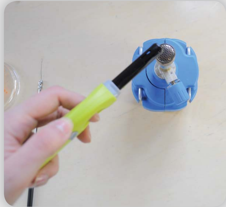
Sterilize your working space by applying alcohol and firing the gas burner