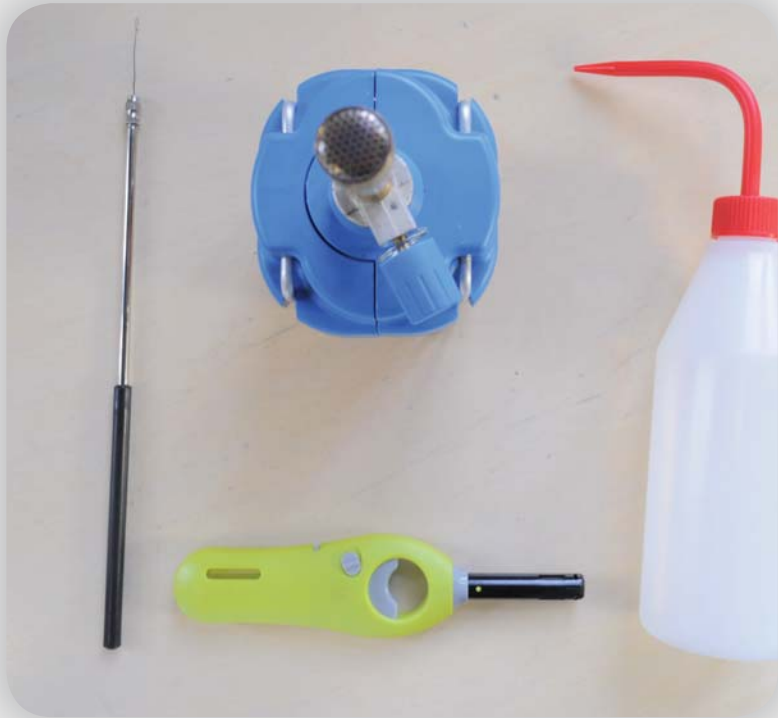
Gather your tools